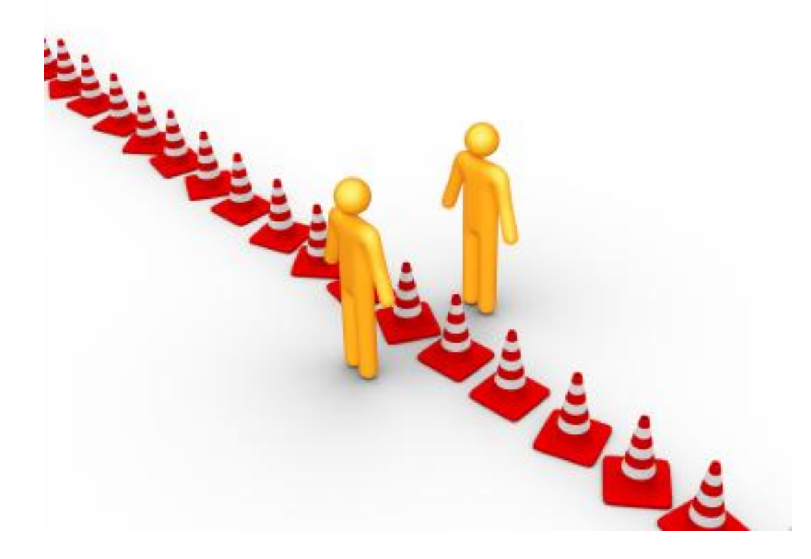
<u>This Photo</u> by Unknown Author is licensed under CC BY-ND