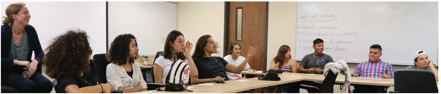
CAMP students participate in a discussion during a group therapy activity.