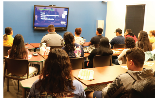
NMSI presents internship opportunities to the CAMP group through a webinar.